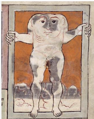
Fig. 1. Blemmye, The Wonders of the East , London, British Library, MS Cotton Tiberius B.v., fol. 82r (detail)

The future is necessarily monstrous: the figure of the future, that is, that which can only be surprising, that for which we are not prepared, you see, is heralded by species of monsters. . . .All experience open to the future is prepared or prepares itself to welcome the monstrous arrivant . . . This is the movement of culture.[1]