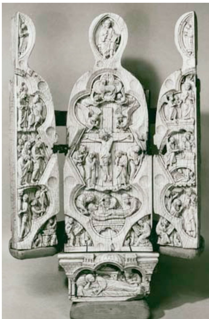
Figure 5. Vierge Ouvrante , French, Walters Museum, Baltimore

A comparative image quite far from these diagramming traditions in both function and execution, but no less striking in its conceptual similarity to the Ashmole diagrams, is offered by the figures known as Vierges ouvrantes , small sculptures of the Madonna and Child carved throughout Europe in the later Middle Ages that fold open to reveal a smaller sculpted image of Christ on the inside – usually either a crucifixion or a mercy-seat trinity.