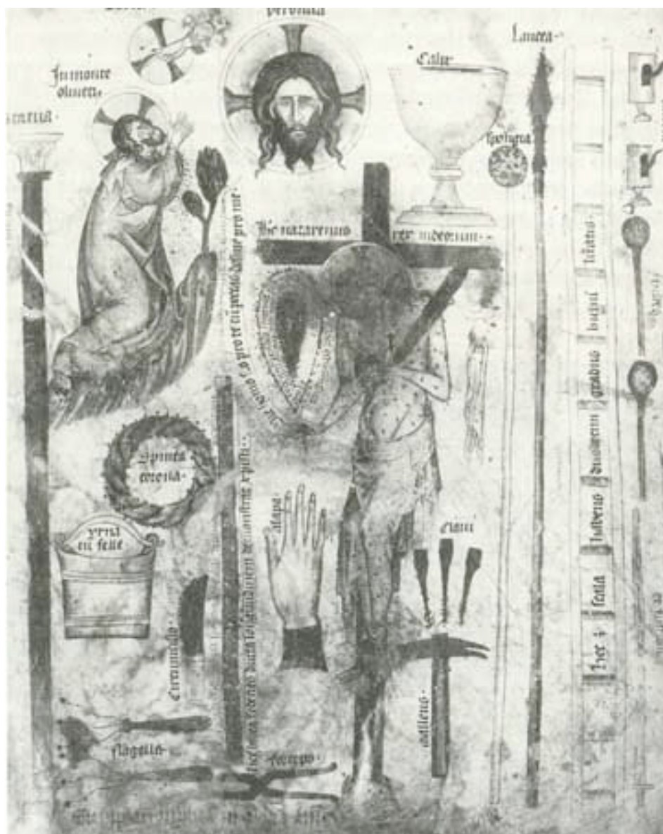
Figure 4. Arma Christi, Passional of Abbess Kunigunde , Prague National Library MS XIV A 17, fol. 3v.

them from the surrounding forms, making the suggestion of a body more pronounced. The two “horns” of the uterus are elongated and provide a neck leading up to the head. At the center of the page, the red lines protruding outward near the cervix call to mind representations of Christ’s loincloth, and as the lines run toward the upper corners, they evoke the graceful curve of the arms so common in English imagery of the crucified Christ during the thirteenth century.