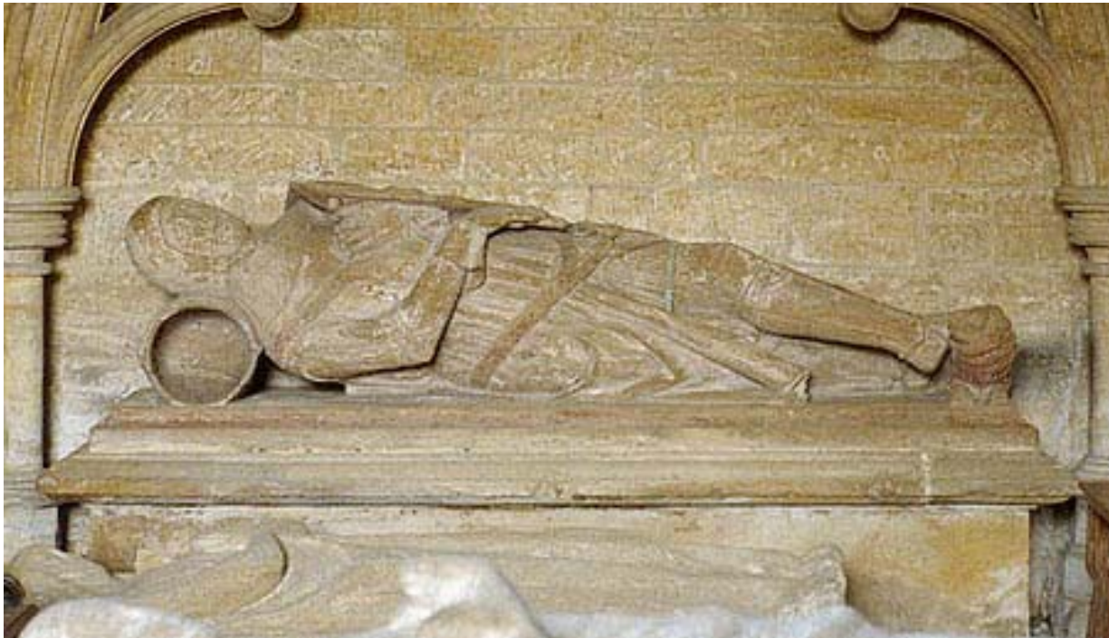
Figure 2. Tomb of Richard Gyvernay , ca. 1329, St. Mary's Church, Limington

chausses, mail leg protections, covered by a calf-length surcoat split up the center to reveal the crossed legs. His knees and legs display metal or cuir bouilli poleyns and greaves, while his arms bear vambraces and his hands are gauntleted. His head is covered by a bascinet over a coif with chinstrap. The figure's costume bears much more carved detailed than that any of the other figures. The links of the mail, seams and joins of the vambraces and greaves, and finger plates of the gauntlets are carefully delineated. The poleyns display carved foliate crosses and the greaves, scroll ornamentation. The shield bears a clearly visible heraldic charge of a bend between six scallop shells. With its polychrome intact, some of which is still visible, this figure must have been quite spectacular.