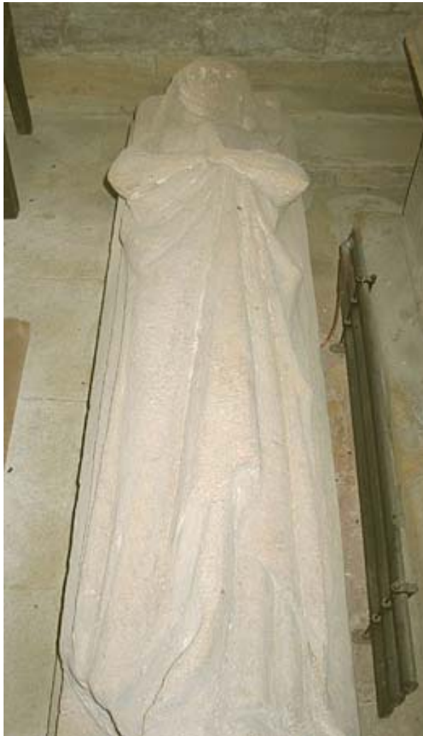
Figure 3. Tomb of Gunnora , ca. 1300, St. Mary's Church, Limington

The third tomb in the chapel's space is installed under the arch connecting the chapel to the nave, opposite the knight's tomb (Figure 4). It is a sizeable double monument displaying a female and a male figure. The woman lies in the traditional pose for English medieval female tomb effigies with extended legs and hands folded in prayer. She wears the standard costume characterizing English women's effigies of the 1340s: her legs and feet are concealed by the gently curving tubular folds of a long kirtle with tightly laced sleeves, while her upper body's slender shape is revealed by the close-fitting surcoat. Her head is covered by a wimple and a long veil with a chinstrap. The man lies in much the same pose, but his legs are crossed like those of the nearby knight's figure, as revealed by the split skirt of a thigh-length tunic under a tight-fitting surcoat. His arms, clad in tightly-laced sleeves like those of the woman, display elbow-length tippetts and end in folded hands. His head is bare, but draped around his neck and shoulders is a hood. At his side hangs a sword in its scabbard.