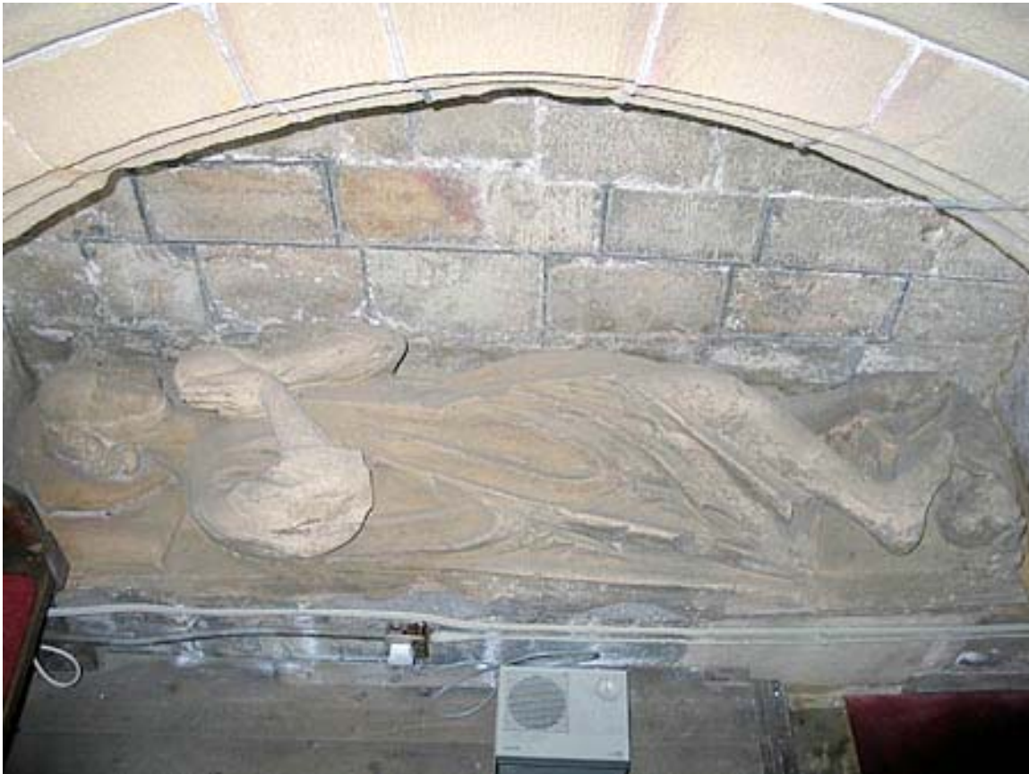
Figure 5. Tomb of a Civilian (Possibly a Member of the Everynham or Hathelseye Family), St. Mary's Church, Birkin, Yorkshire, Early-Fourteenth Century