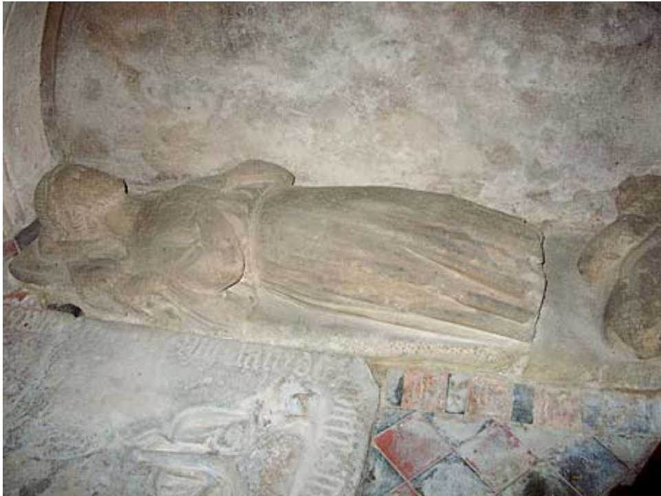
Figure 6. Tomb of a Civilian (Possibly a Member of the Turville Family) , All Saint's Church, Thurlaston, Leicestershire, Early-Fourteenth Century