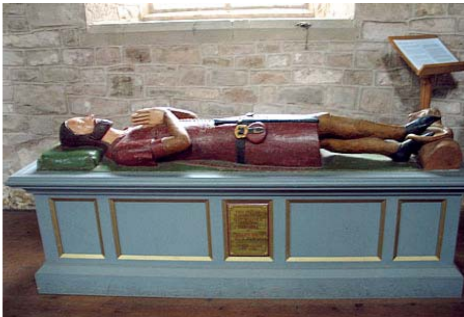
Figure 7. Tomb of a Civilian (Possibly Walter de Helyon) , St. Bartholomew's Church, Much Marcle, Herefordshire, ca. 1360-70