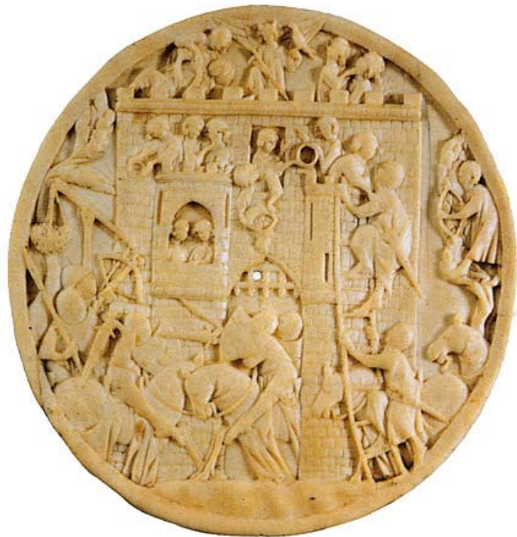
Figure 8. Mirror Case with Attack on the Castle of Love , Baltimore, Maryland, Walters Art Gallery (71.169)

The examples cited above employ the female body itself as the object of the male lover's gaze or touch; however, one common theme on ivory luxury objects prefers a more metaphorical approach by casting courtship as actual or ritual warfare in which knights enact the lover's role and the besieged castle represents the female love object. The theme of the Assault on the Castle of Love or its variation, The Joust Before the Castle of Love, which appears on several surviving mirror backs and caskets, features armored warriors attacking a fortification while female defenders pelt them with roses or knights tilting in front of a castle gate witnessed by a female audience (Figure 8). As Susan Smith points out, the presence of the God of Love presiding over the action indicates the erotic nature of the conflict. 60 In these examples, the castle acts as a metaphor for the female body defended against invasion, although not always successfully. Defensive measures are two-fold in these images: women defend themselves with floral weaponry, but more effective are the castle walls and turrets which shelter the