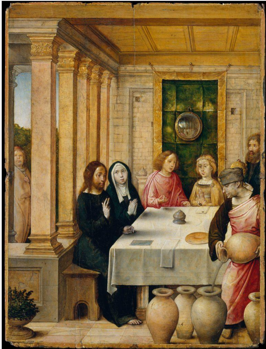
Figure 5. Juan de Flandes, The Marriage Feast at Cana. Ca. 1500-1504. The Metropolitan Museum of Art, The Jack and Belle Linsky Collection, 1982.

created at the Spanish Court for a multi-paneled, large retablo that seems never to have been assembled. When Isabella died in 1504, forty-seven small panels with scenes of the life of Christ were put up for sale to pay off her debts; thirty-two of them (including the one now in New York) were purchased for Margaret of Austria's collection by an agent.[31] Dürer admired them during his visit to Mechelen in 1521, noting in his diary that he had seen about forty small oil pictures among Margaret's beautiful things, the likes of which "for precision and excellence" he had never before beheld.[32]