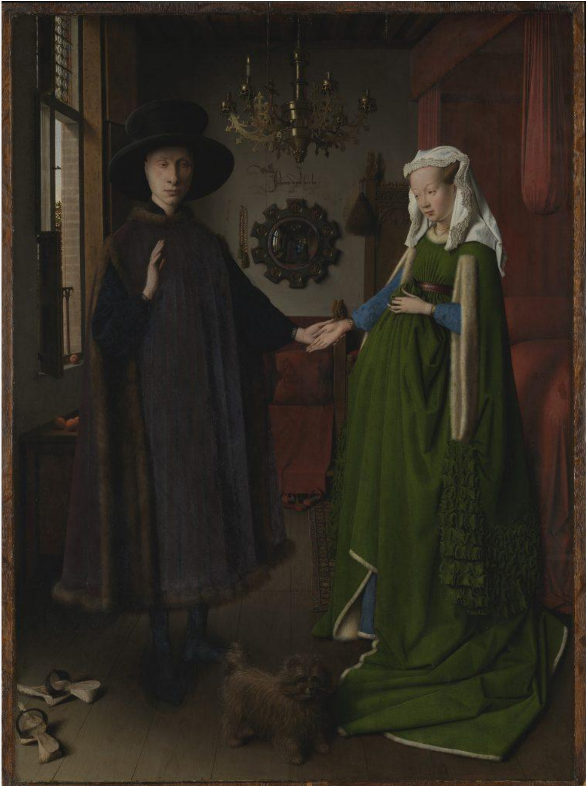
Figure 2. Jan van Eyck, Portrait of Giovanni (?) Arnolfini and his Wife. 1434. The National Gallery London.

Linda Seidel, "Poor Little Rich Girl(?): Margaret of Austria and the Arnolfini Portrait," Different Visions: New Perspectives on Medieval Art 8 (2022): 1-24.