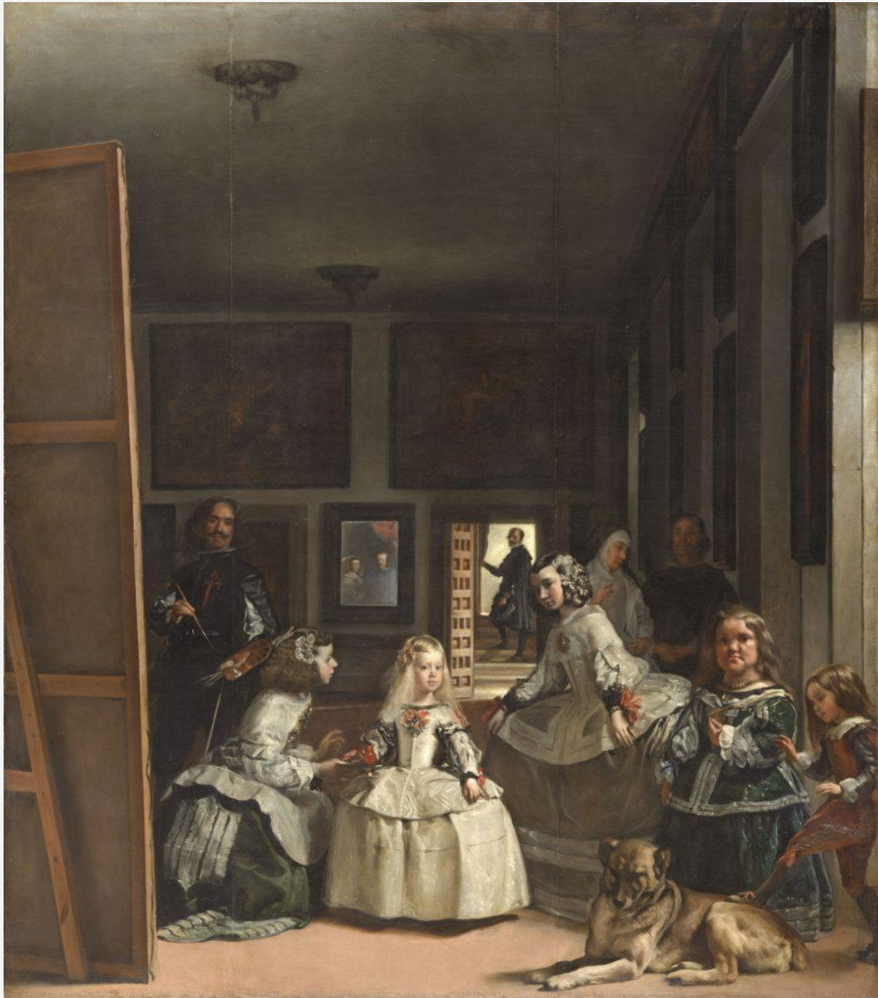
Figure 1. Diego Velázquez, Las Meninas . 1656. Museo Nacional del Prado.

decades after the painting was made, instead of proceeding, as is usually done, by rehearsing scholarly claims?