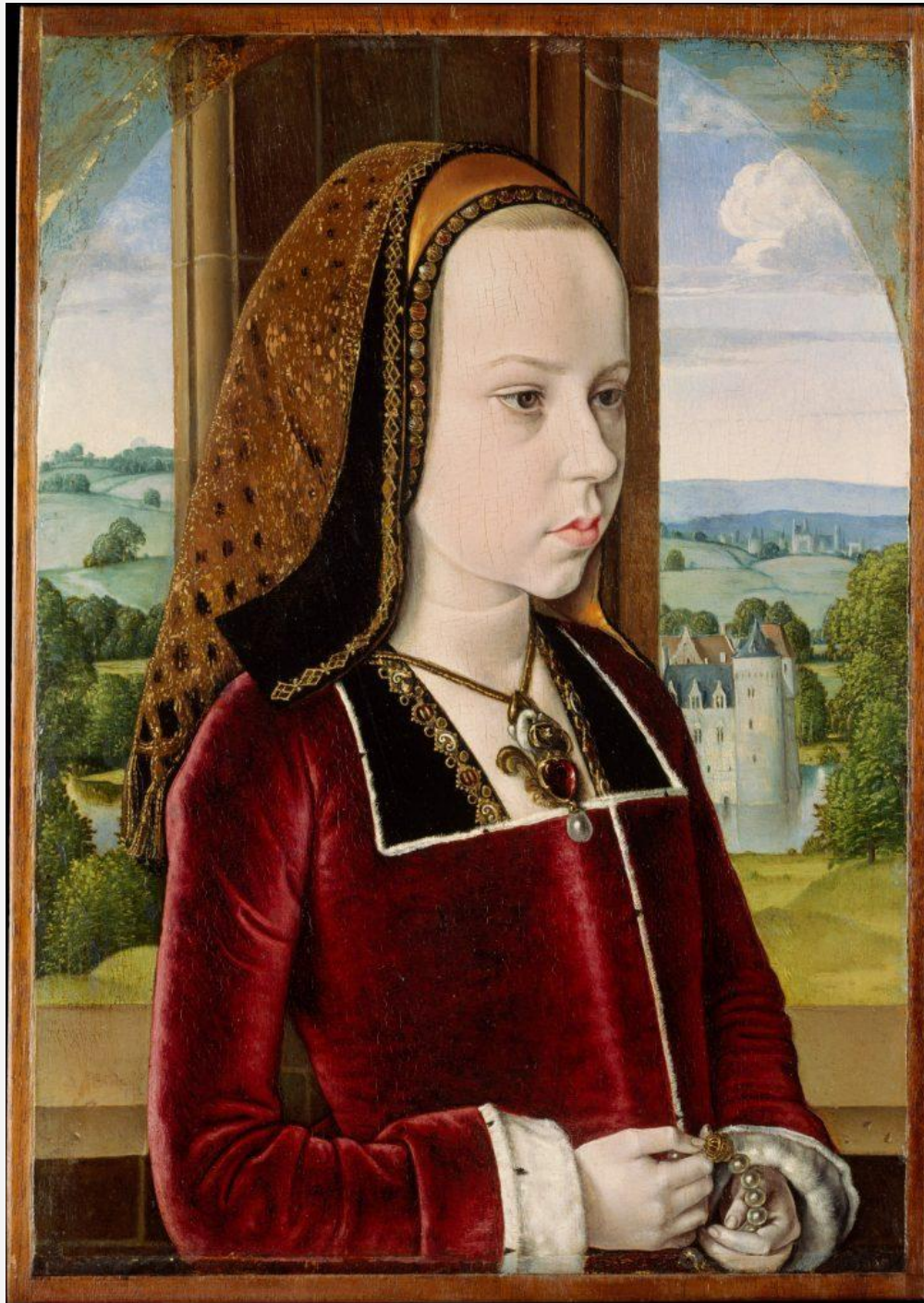
Figure 3. Jean Hey (Master of Moulins), Margaret of Austria. Ca. 1490. The Metropolitan Museum of Art, New York, Robert Lehman Collection, 1975.

him in the slightly older Anne of Brittany. A portrait, made around 1490, shortly before the repudiation, shows a richly clad Margaret at about age ten. (Fig. 3).