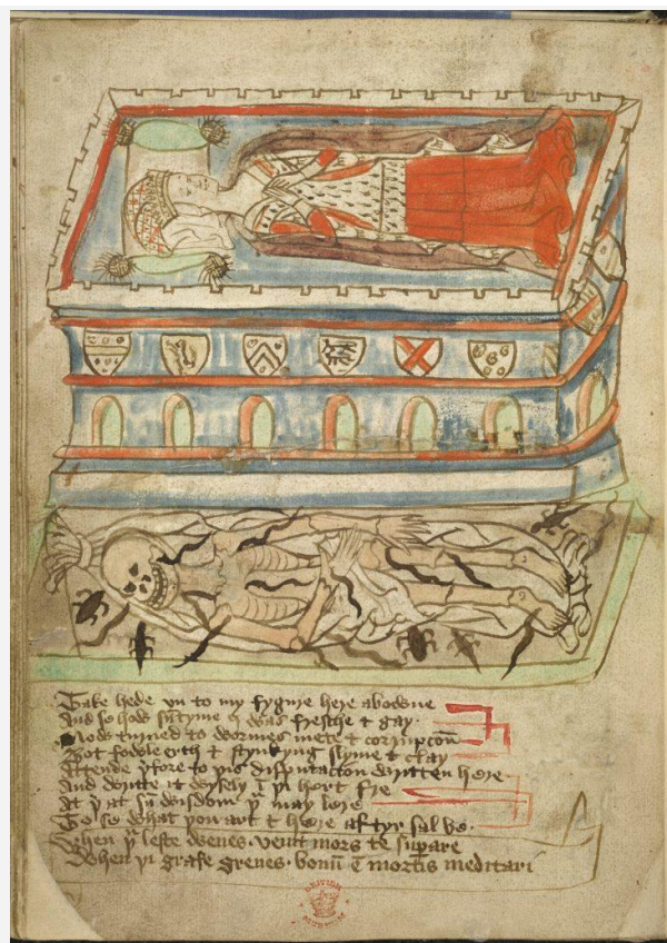
Figure 2. Effigy tomb and open grave from “A Disputation Between the Body and Worms.” Carthusian Miscellany, northern England (c. 1460-70). © British Library Board. British Library Additional MS 37049, f. 32v.

beneath it and with that to reveal the truth of death as bodily decay and dissolution, a truth that the effigy tomb sought to deny. Binski identified that sense of revelation and truth-telling in the double-decker transi tombs as well, writing that they “overcame this erasure of the body by the effigy; they performed a kind of unmasking of that which had hitherto been concealed ...revealed the skeleton in the cupboard of medieval funerary art, namely its denial of the facts of decomposition.” [33] Finally, the juxtaposition of the living and dead forms of the individual that is represented in these miniatures and created in the double-decker transi tombs is associated with truth-telling in the inscription on the tomb of the Black Prince (d. 1376). Although the tomb itself is an effigy monument, the inscription contrasts the Prince in life – “Great riches here did I possess whereof I made great nobleness. I had gold, silver, wardrobes and great treasure, horses, houses, land” – with him in death – “But now a poor caitiff am I, deep in the ground lo here I lie. My great beauty is all quite gone, my flesh is wasted to the bone. My house narrow and throng” – and then states that “nothing but truth comes from my tongue.” [34]