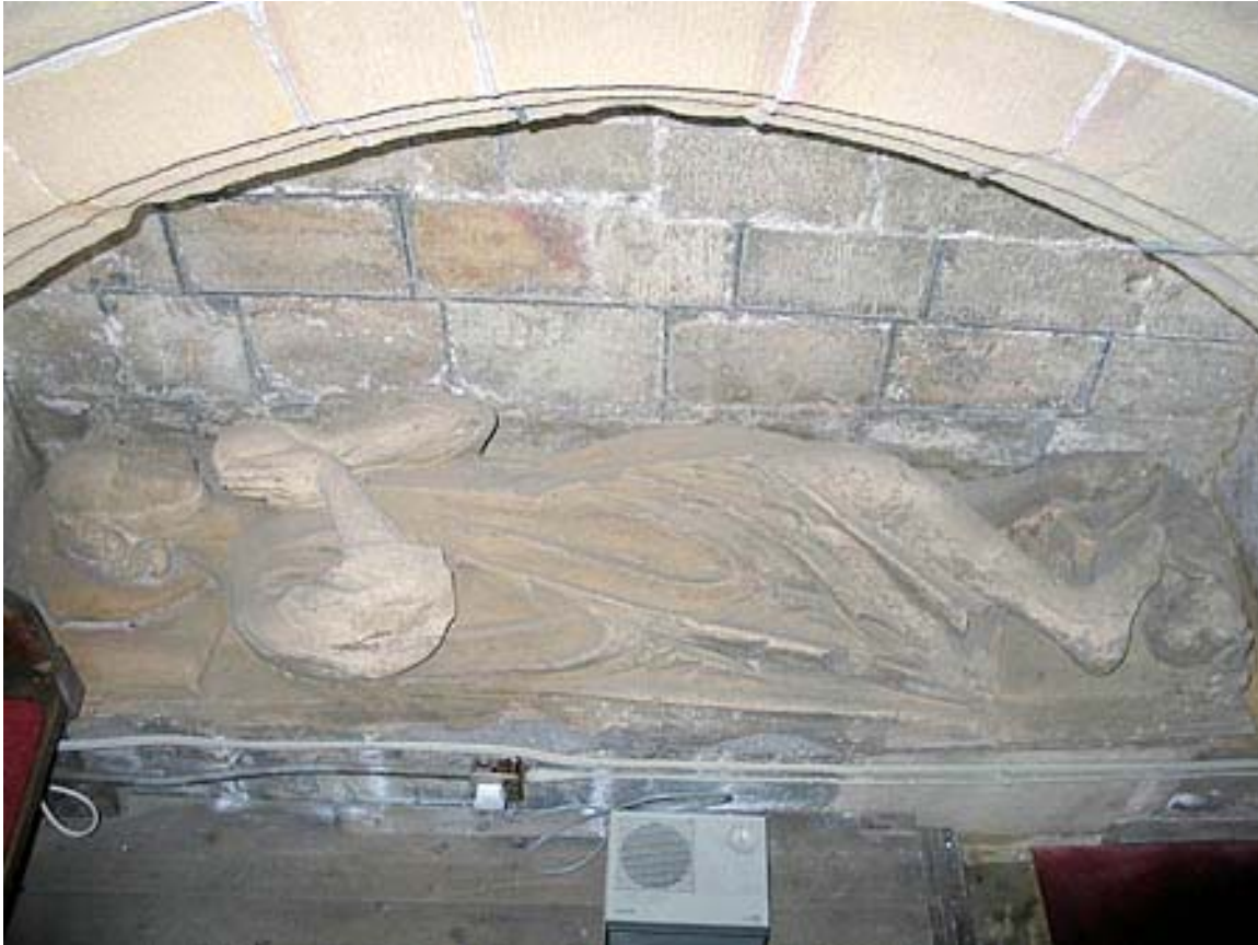
Figure 5. Tomb of a Civilian (Possibly a Member of the Everynham or Hathelseye Family), St. Mary's Church, Birkin, Yorkshire, Early-Fourteenth Century