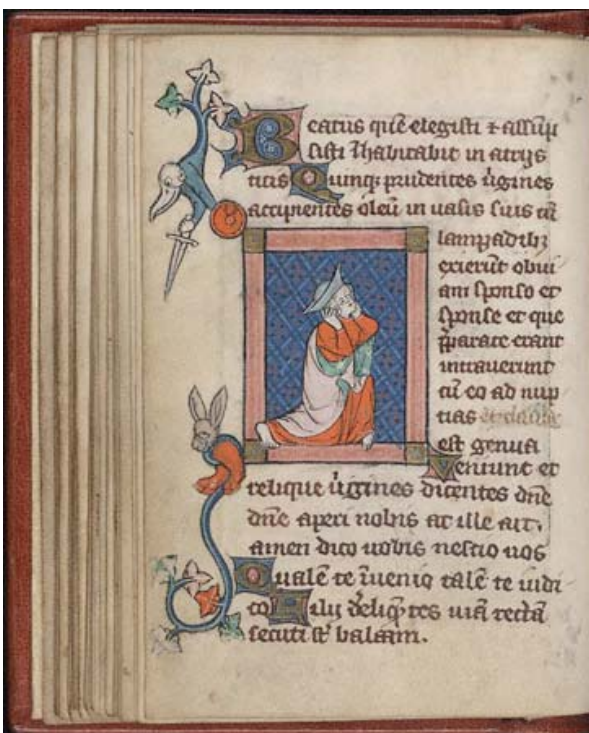
Figure 29. Rothschild Canticles , ca. 1300, Beinecke Rare Book and Manuscript Library, Yale University, MS 404, fol. 29v.