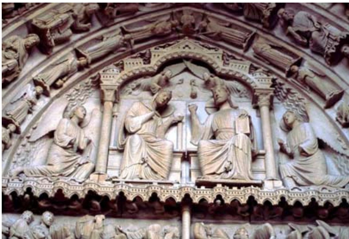
Figure 3. Coronation of the Virgin , Central Portal, North Porch, Cathedral of Notre-Dame of Chartres, c. 1205 – 1215, Photo: c. Jane Vadnal.

by containers of aromatic spices, a reference to the Song of Songs 4:10, which appears on the facing verso. Below, winter is depicted abstractly with white flakes against a black background, and spring as green plants, trees and a bird. These natural forms refer to the change of seasons described in Song of Songs 2:11-12. Fragments of these verses are also found on the verso. 8 In this enticing heavenly representation of divine union, the Sponsa is depicted in a submissive manner in relation to Christ. She looks downward, tilts her head and defers to Christ to be crowned. In this observation, I am inspired by Madeline Caviness's description of a similar image, the Coronation of the Virgin Mary on the central north portal at Chartres (Figure 3):