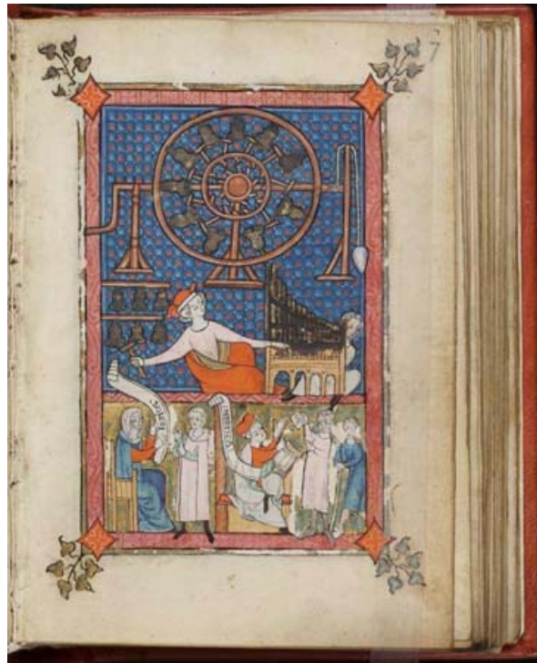
Figure 8. Rothschild Canticles , ca. 1300, Beinecke Rare Book and Manuscript Library, Yale University, MS 404, fol. 7r.