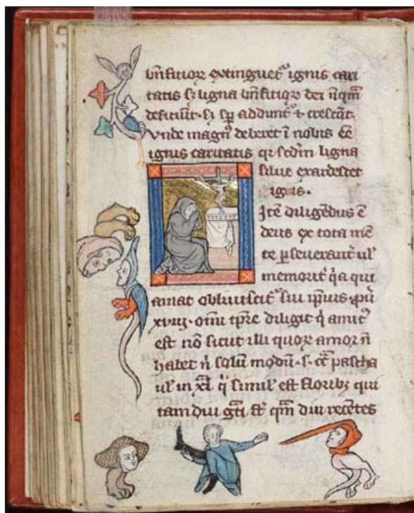
Figure 27. Rothschild Canticles , ca. 1300, Beinecke Rare Book and Manuscript Library, Yale University, MS 404, fol. 164v.