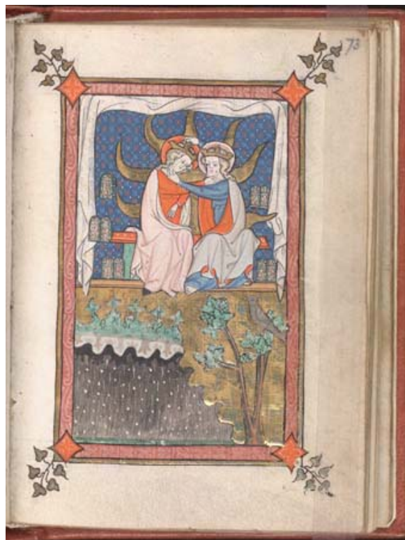
Figure 2. Rothschild Canticles , ca. 1300. Beinecke Rare Book and Manuscript Library, Yale University, MS 404, fol. 73r.

The identity of the patron of this manuscript is unknown. Hamburger has posited that a highly educated female monastic patron was guided by a Dominican male advisor, who may have also compiled the text. 7 On fol. 73r, Christ as the heavenly bridegroom crowns the Sponsa . Both figures are encompassed by the rays of the sun and surrounded