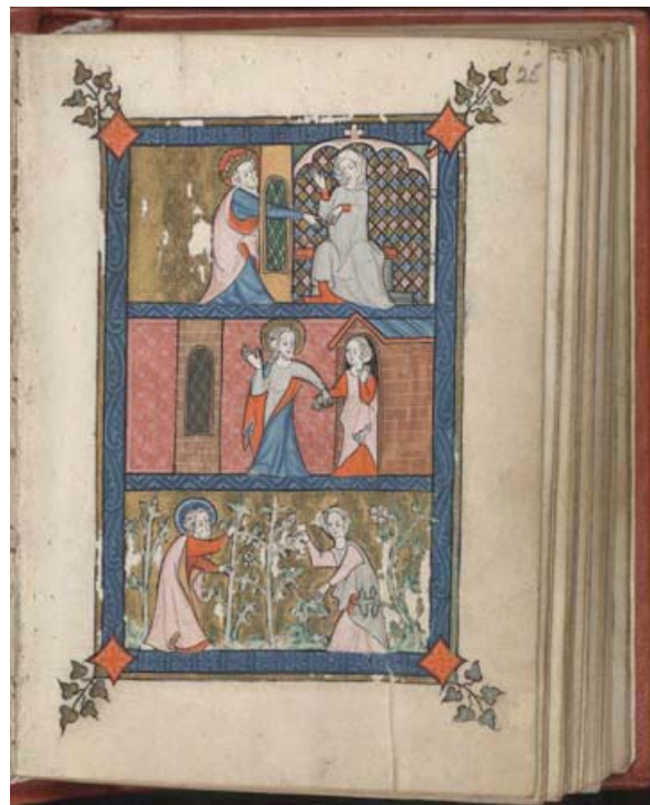
Figure 5. Rothschild Canticles , ca. 1300, Beinecke Rare Book and Manuscript Library, Yale University, MS 404, fol. 25r.

It is no accident that both of these images of women—the Virgin Mary and the Sponsa —exhibit such passivity. Drawing upon Carol Clover's modern film theory and Caroline Walker Bynum's historical studies, I will demonstrate that the soul has been gendered female in the Rothschild Canticles in order to indicate supplication and