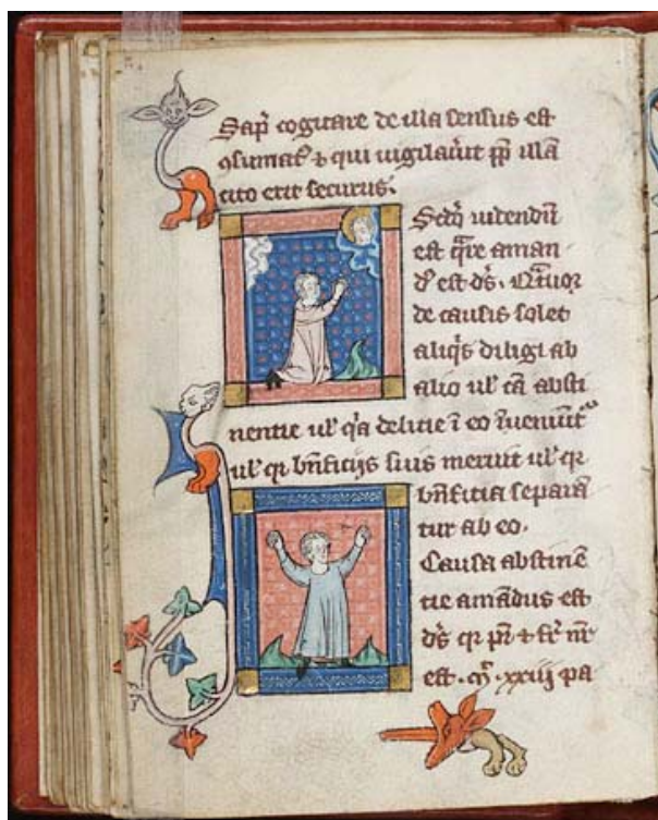
Figure 15. Rothschild Canticles , ca. 1300, Beinecke Rare Book and Manuscript Library, Yale University, MS 404, fol. 165v.

Although the focus of this article is not an in-depth analysis of the textual passages, I have discussed these excerpts in order to demonstrate that the language does not depend on the gendered description of love between God and a soul from the Song of Songs. In contrast, many of the excerpts on fol. 72r from the Song of Songs praise the head, neck, lips, and breasts of the Sponsa . Moreover, images of male figures whose gestures and actions reveal admiration for Christ frequently appear throughout the entire manuscript, beyond the gathering of fols. 161r – 166v. Pamela Sheingorn has also noticed the prevalence of male figures in the Rothschild Canticles and, most importantly, has observed that these hermits, monks, and seers appear more often than the female representation of the soul. 35