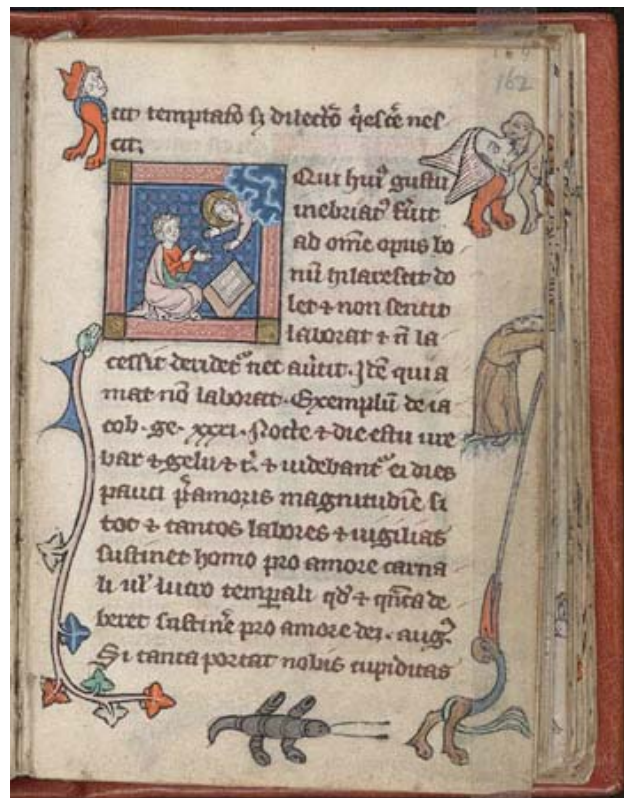
Figure 19. Rothschild Canticles , ca. 1300, Beinecke Rare Book and Manuscript Library, Yale University, MS 404, fol. 162r.

These figures of an indeterminate gender in Rothschild Canticles resemble angels in two French manuscripts produced at the same time as the Rothschild Canticles , around 1300. The Ruskin Hours exhibits an Annunciation scene within a historiated initial (Figure 20) in which the angel has the same short curly hair, beardless face and draping garments as many of the figures without a clear gender in the Rothschild Canticles . An illumination from La Somme le Roi , written by the Dominican Père Laurent for Philip III of France (c. 1279), also includes the three angels that visit Abraham to announce that Sarah will bear a child (Figure 21). These angelic figures manifest the same androgynous characteristics,