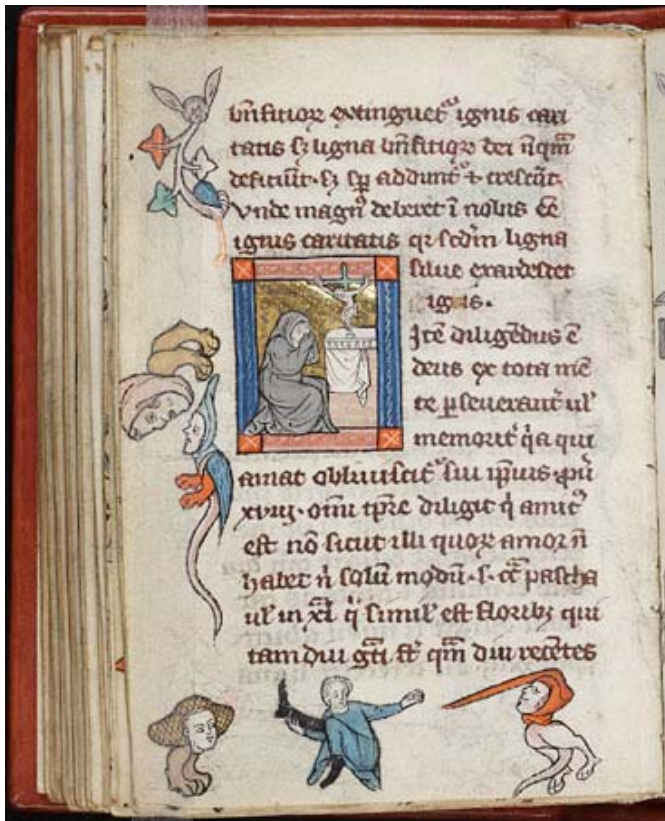
Figure 13. Rothschild Canticles , ca. 1300, Beinecke Rare Book and Manuscript Library, Yale University, MS 404, fol. 164v.

On the lower illumination of fol. 161r, a young, crowned boy kneels before an altar and prays while looking in the direction of Christ’s hand extending from behind a blue cloud-like formation in a gesture of blessing (Figure 11). This small illumination is accompanied by excerpts from a text by Augustine that celebrates loving God with one’s mind and a passage by Gregory regarding labor that is motivated by loving God. 29 On fol. 162r, a young boy kneels in front of a book while pointing toward an equally youthful Christ, whose arms and head extend from a cloud-like formation (Figure 12). The two face each other, Christ’s hands extending toward the youth. This interaction between a boy and Christ illustrates a lengthy passage that explains that the labor of loving God does not involve the pain, suffering, and exhaustion normally associated with the labor of acquiring carnal love and earthly wealth. 30 On fol. 164v, a monk kneels before a crucifix (Figure 13), a