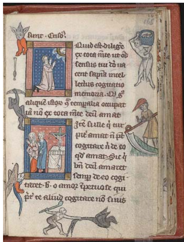
Figure 18. Rothschild Canticles , ca. 1300, Beinecke Rare Book and Manuscript Library, Yale University, MS 404, fol. 165r.

lack of a fully developed male sexuality, I recognize the necessity of conceiving of these figures as genderless. If sex, at its most basic level of definition, refers to the biological structure of a person, and gender to a cultural construction, then I must refer to these figures in terms of gender, or in this case, a lack thereof. As part of an image that was likely fashioned by the combined efforts of the illuminator, manuscript designer, theological advisor/compiler and the patron, these androgynous figures are a cultural production.