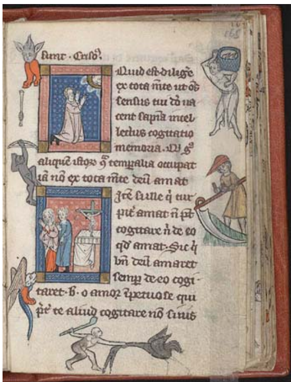
Figure 14. Rothschild Canticles , ca. 1300, Beinecke Rare Book and Manuscript Library, Yale University, MS 404, fol. 165r.