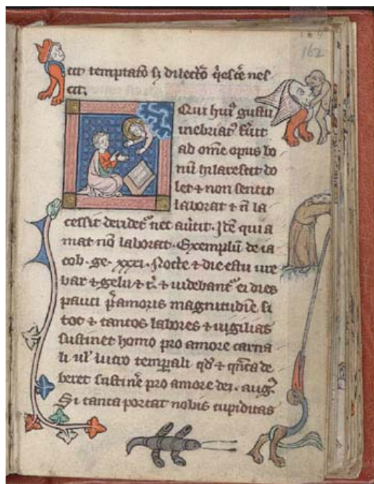
Figure 12. Rothschild Canticles , ca. 1300, Beinecke Rare Book and Manuscript Library, Yale University, MS 404, fol. 162r.