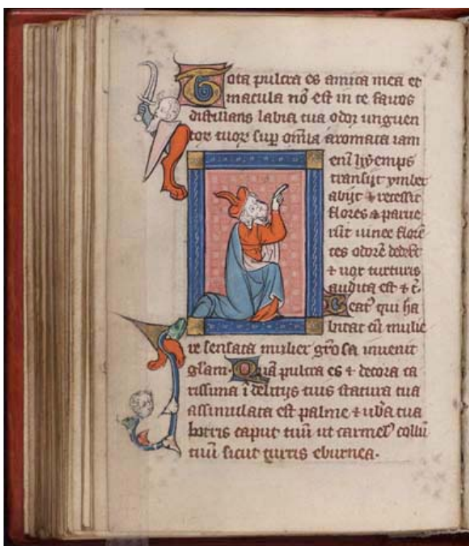
Figure 1. Rothschild Canticles , ca. 1300, Beinecke Rare Book and Manuscript Library, Yale University, MS 404, fol. 72v.

Canticles would also have been able to see his spiritual quest for divine union embodied in a female figure. 4 Corine Schleif has suggested that an investigation of male readership would be a useful endeavor. 5 The possibility of a male audience invites further investigation. This article will begin with an exploration of the process by which a male reader could perceive of himself as the bride of Christ by looking at a female representation of the soul. Although the Sponsa is depicted many times in the Rothschild Canticles , I will focus on the opening of fols. 72v – 73r (Figures 1 and 2). Although I believe a female reader may have also used the manuscript, I will restrict my discussion to a male reader's perspective. 6