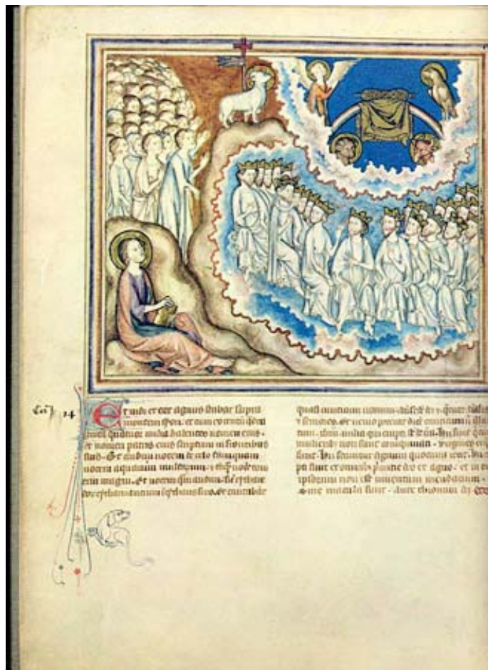
Figure 23. Cloisters Apocalypse, 1320, The Metropolitan Museum of Art, The Cloisters Collection, 1968 (68.174), fol. 25v.