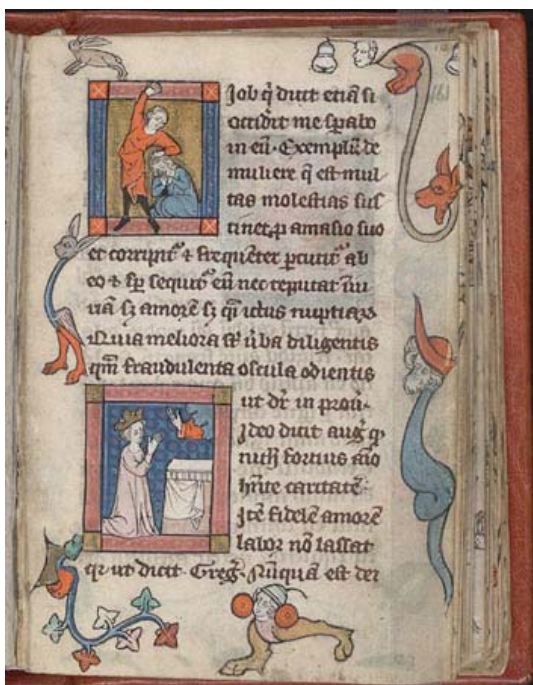
Figure 11. Rothschild Canticles , ca. 1300, Beinecke Rare Book and Manuscript Library, Yale University, MS 404, fol. 161r.

The image of the monk reaching for Christ in a gesture of devotion and admiration on fol. 163r is one of many incidents of a male figure adoring Christ. This illumination appears in a gathering consisting of fols. 161r – 166v and containing a compilation of texts from an unidentified florilegium or glossed Bible. As Hamburger has noted, this gathering includes many exegetical comments on Biblical passages regarding the proper and improper ways to love God, a theme which is developed throughout much of the Rothschild Canticles . 28 Although Hamburger briefly but perceptively contextualized this collection of textual excerpts within the broader themes of this manuscript, he did not explore their accompanying illuminations and the differences between these texts on love and other texts in the Rothschild Canticles , which reveal that there are other models of devotion accessible to a man besides those involving imagining himself in a position of feminized submission. Many of these figures sit or kneel while reading or praying in the presence of a divine face, hand, or body that emanates from the clouds; others kneel before an altar which often displays a crucifix. These illuminations accompany a text that conceptualizes love for God without the eroticized language from the Song of Songs found in earlier parts of the Rothschild Canticles .