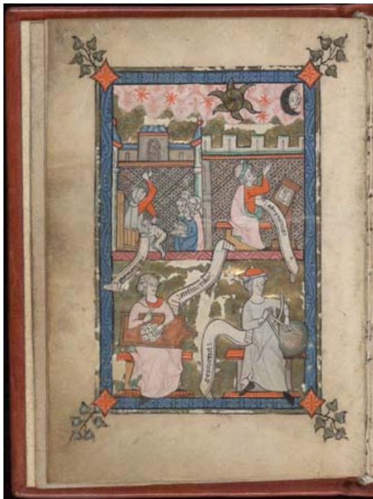
Figure 7. Rothschild Canticles , ca. 1300, Beinecke Rare Book and Manuscript Library, Yale University, MS 404, fol. 6v.