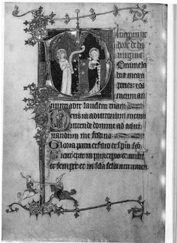
Figure 20. Initial D: The Annunciation; Initial D: A Young Man Praying to Christ in the Clouds, The Ruskin Hours , beginning of the fourteenth century, 26.4 x 18.3 cm., The J. Paul Getty Museum, Los Angeles, California, 83.ML.99.37v.

round beardless faces and loosely draped clothing as the figures in the Rothschild Canticles .