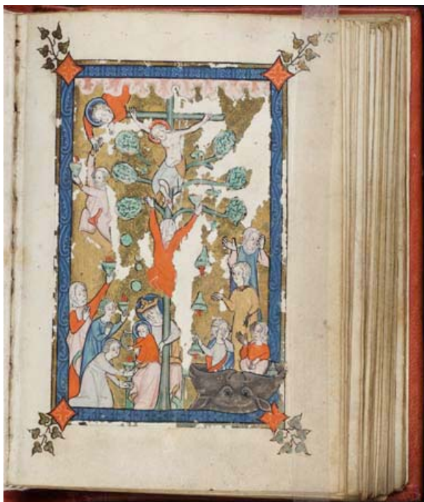
Figure 4. Rothschild Canticles , ca. 1300, Beinecke Rare Book and Manuscript Library, Yale University, MS 404, fol. 15r.

manifests several other instances in which the gestures, positions, and actions of the Sponsa express a similar degree of subservience. For example, on fol. 15r a figure who represents both a Wise Virgin and a Sponsa kneels below the Christ child, who is about to crown her with a green wreath (Figure 4). 10 A second Wise Virgin/ Sponsa relies on Christ's strength to be pulled toward the Heavenly realm from which he descends; she ascends not through her own agency, but through Christ's power. On fol. 25r, the top register includes a Sponsa demurely looking downward while meekly offering her hand to the crowned Christ, who aggressively reaches through a window to grasp her hand; in the middle register, Christ leads the Sponsa out of a small building, grasping her by the hand, thus reinforcing her submission (Figure 5). 11