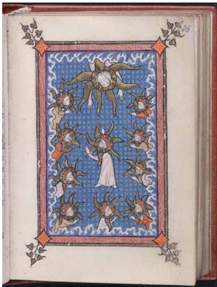
Figure 30. Rothschild Canticles , ca. 1300, Beinecke Rare Book and Manuscript Library, Yale University, MS 404, fol. 38r.

Exposing androgyny may appear to risk a reversal of the scholarship that has so necessarily inserted an awareness of gender into the study of medieval art and history over the past few decades. Yet the Rothschild Canticles does not privilege ungendered over gendered models of devotion or vice versa. The presentation and structure of the manuscript's illuminations do not allow either conception of spirituality to displace or dominate the other. The Sponsa-Sponsus imagery is emphasized through a series of full-page illuminations such as fol. 73r (Figure 24), replete with extensive amounts of gold leaf and costly pigments. An equally powerful visual phenomenon, the androgynous figures, appear not just on folios 161r-166v (Figures 25-28), but from the beginning to the end of the Rothschild Canticles . These figures guide and imitate the viewer's looking process. Many, such as that on fol. 29v (Figure 29), appear in texts opposite full-page illuminations. Others can be found hovering in celestial space below Christ, e.g. on fol. 38r (Figure 30).