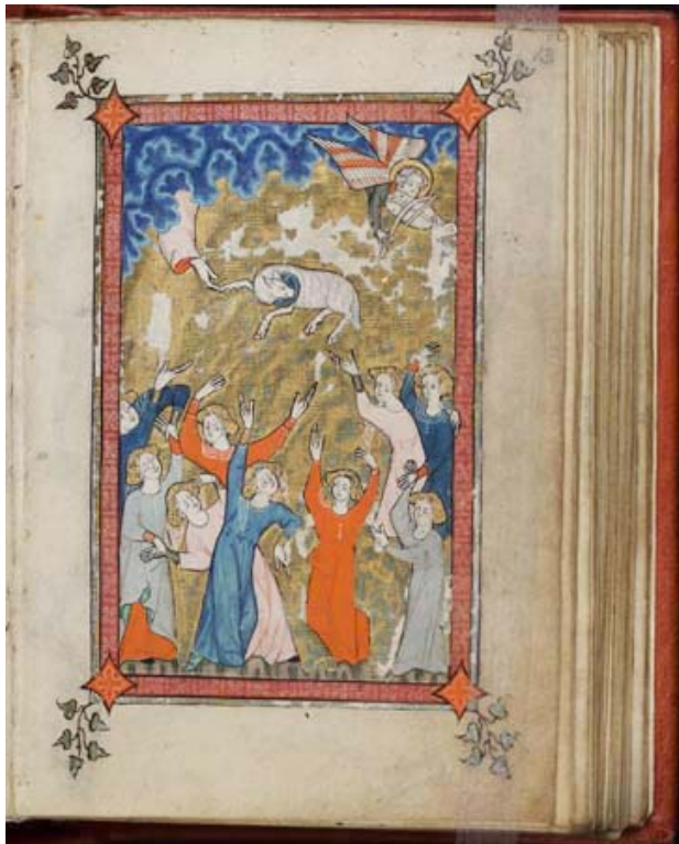
Figure 16 Rothschild Canticles , ca. 1300, Beinecke Rare Book and Manuscript Library, Yale University, MS 404, fol. 13r.

The worshippers of Christ on folios 161r, 162r, 165r, 165v, and 166r can be reevaluated in terms of their ungendered appearance. Initially, I classified these figures as