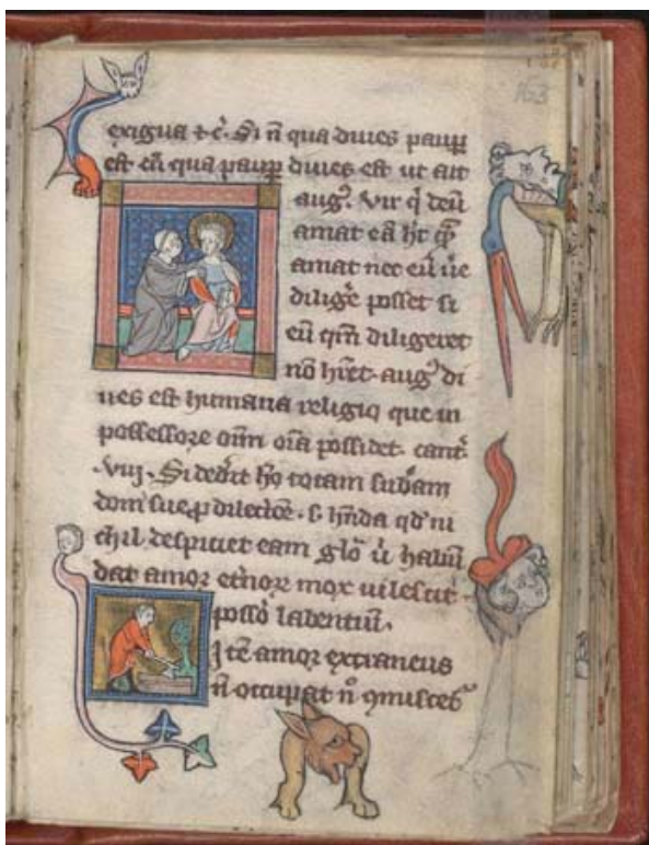
Figure 6. Rothschild Canticles , ca. 1300, Beinecke Rare Book and Manuscript Library, Yale University, MS 404, fol. 163r.

might eventually want to deny this sort of identification. Carol Clover has demonstrated that the modern slasher film provides a psychological apparatus in its narrative to allow the male viewer to cease identifying with characteristics that are gendered female. A common pattern emerges in which a woman is gruesomely beaten, survives the attack, and later kills her attacker. 20 In brandishing a weapon, thrusting it upon her victim and assuming an aggressive male gaze she becomes phallicized. 21 This narrative device regenders this victim-turned-hero as male. In a parallel way, the Rothschild Canticles imagery suggests that affection for Christ can also be gendered male. When looking at a subsequent image, on fol. 163r, the male reader and viewer can resist the act of feminizing his religious devotions by identifying with the monk who replaces the Sponsa's physical and spiritual position (Figure 6).